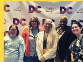
Board members and advocates at the National Arc Convention in DC